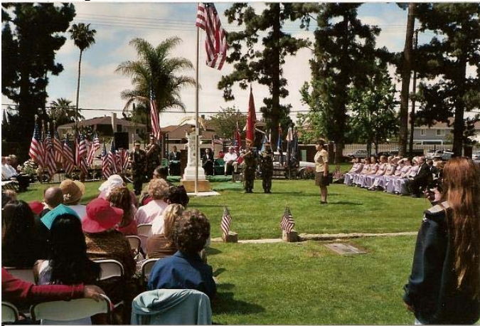
The Tustin Young Marines provide a color guard and performed the Flag Folding Ceremony at Santa Ana Cemetery. The Orange High School Chamber Choir (seated at right) delivered stirring patriotic musical interludes.