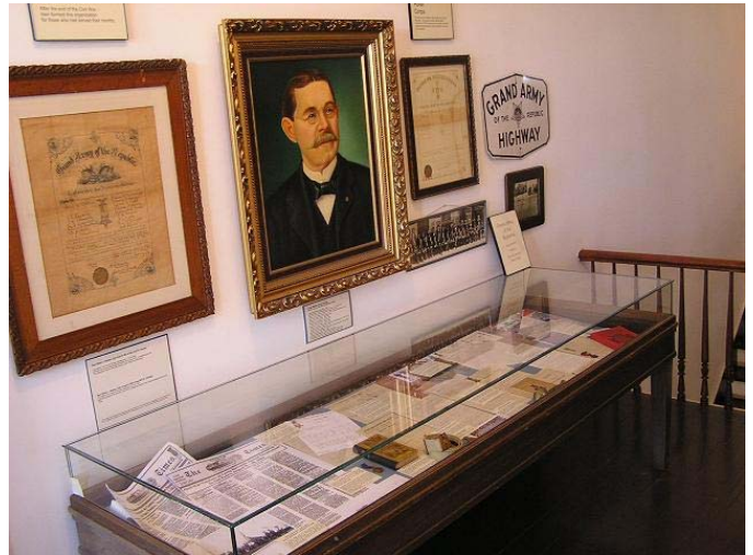
GAR display of Patriotic Hall Allied Orders artifacts at Drum Barracks. The display will remain on view through the Christmas event & Dec.