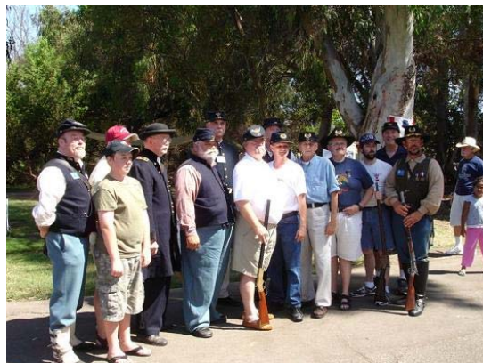
Drum Barracks, SUVCW & DUCW, and USMCHC tents at Huntington Beach. 14 of the 19 Sons who attended the SUVCW booth at H.B.