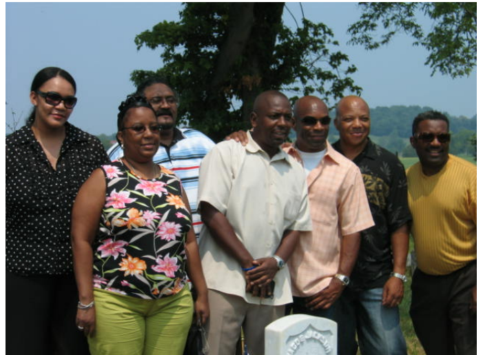
Nelson family members gather at the dedication ceremony.