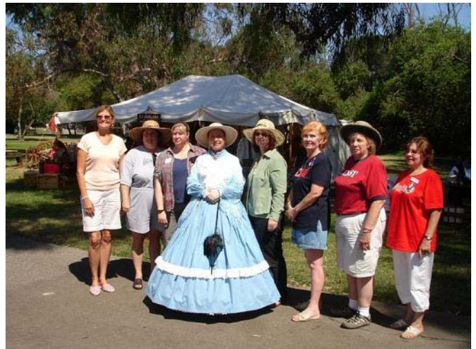
Ladies of the ASUVCW & DUVCW at H.B. on Sunday in casual wear.