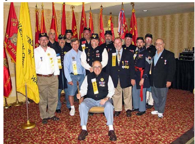
Dept. of Calif. & Pacific Delegation at National Encampment

Section 2: We should take inspiration from these awards and acknowledgements and continue to recognize the Boys in Blue.