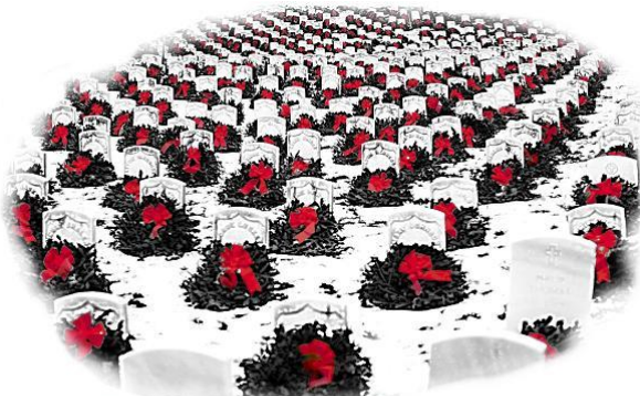
Bottom right: The Wreaths Across America placed at the Veterans Memorial in Brea's Memory Garden Memorial Park on Saturday, December 11, 2010.

WREATHS-ACROSS-AMERICA.ORG REMEMBER - HONOR - TEACH