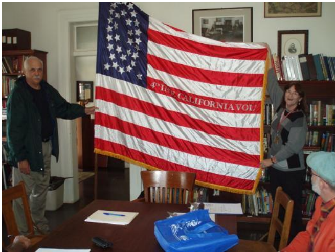
Photo Highlights of Drum Barracks Museum Remembrance Day & City of Wilmington Annual "Heart of the Harbor" Holiday Parade