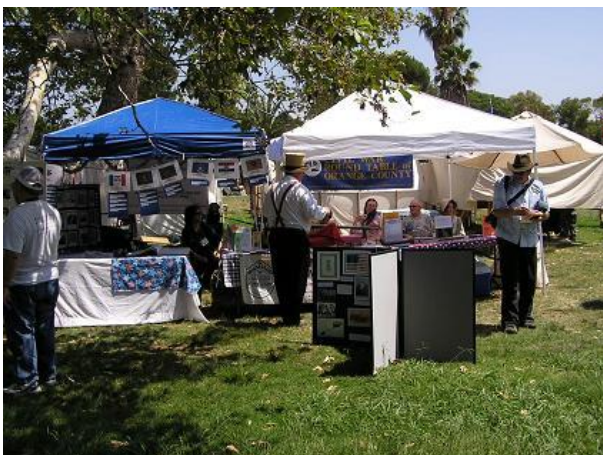
DUVCW Tent 86 (Torrance) booth on the left, and Drum Barracks Civil War Museum booth on the right at El Dorado Park.