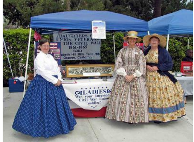
Sons of Camps 2 & 17, and daughters of Tent 88 at St. Catherine's Academy in Anaheim on March 26 & 27.