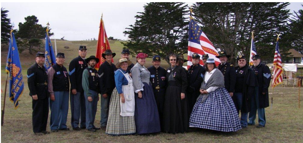
Dept. of California & Pacific members at Fort Mervine.

Fort Mervine was designed by Lt. Henry Halleck in 1846, with construction supervised by Lt. Edward O.C. Ord, and second in command Lt Wm. T. Sherman. In February 1865, during the last months of the Civil War , Co. B, 2 nd U.S. Artillery; Co G, 6 th CA Inf.; and Co. B, 1 st CA Native Cavalry were stationed there.