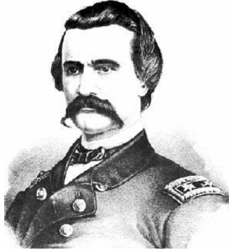
General John A. Logan

I. The 30th day of May, 1868, is designated for the purpose of strewing with flowers or otherwise decorating the graves of comrades who died in defense of their country during the late rebellion, and whose bodies now lie in almost every city, village, and hamlet churchyard in the land. In this observance no form or ceremony is prescribed, but posts and comrades will in their own way arrange such fitting services and testimonials of respect as circumstances may permit.