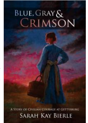
Original Cover Artwork: "Up At First Light" by Cheryl Schoenberger, 2015.

http://gazette665.com/blue-gray-crimson/the-book/