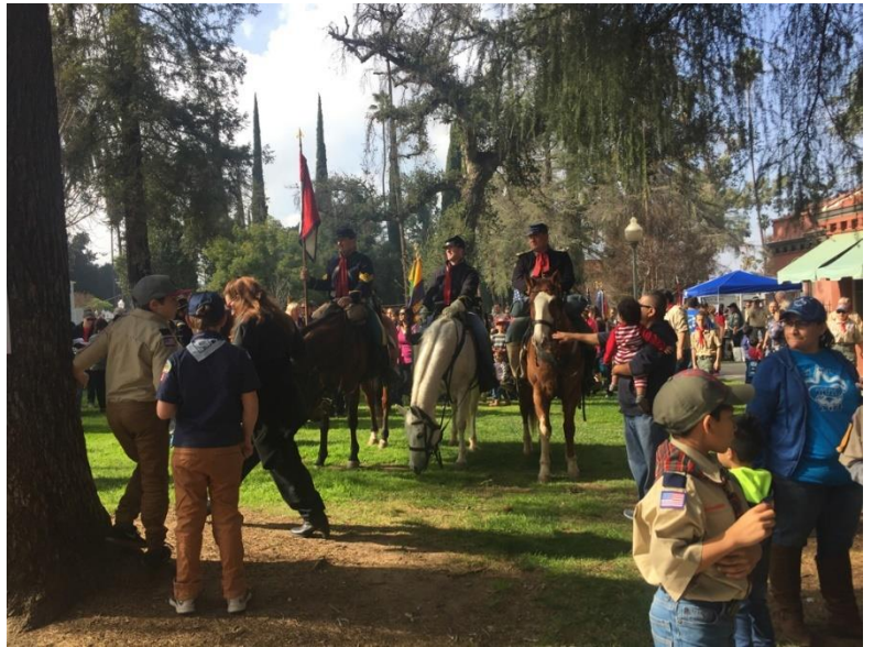
SVR Color Guard - Lincoln Pilgrimage