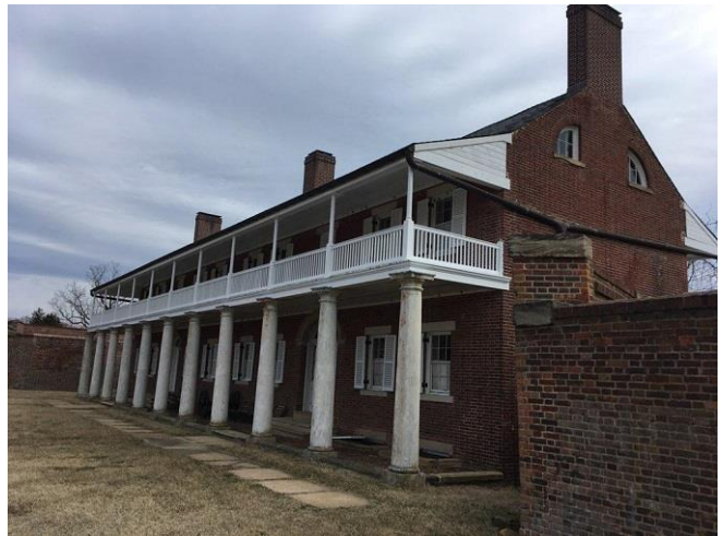
Fort Washington parade ground, flag pole, and barracks. Actually, looks pretty cold in winter, not just “very cool”. (Ed.)