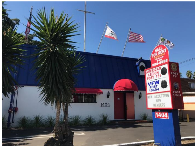
Left: Camp 17 new meeting home, Santa Ana Veterans Hall.

Please attend the Thurs., Mar. 15 meeting, at the Santa Ana Veterans Hall and help plan 2018 activities.