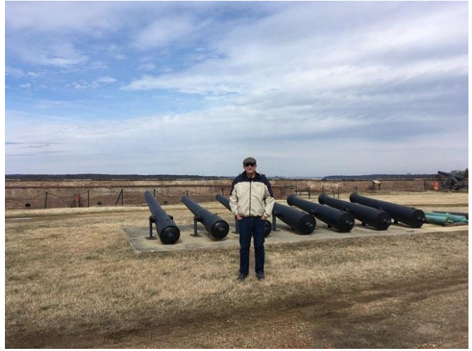
At Alexandria, VA on Presidents Day Parade. The tallest fifer in the parade. Manning the guns at Fort Washington.