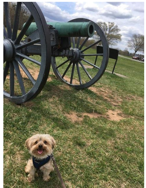
Teddy Roosevelt Hart terrier at Griffin's Battery, Manassas / Bull Run Battlefield Park on April 23, 2018. Shoot him out of a cannon?