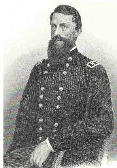
General George Stoneman Jr. Camp 18 Officers