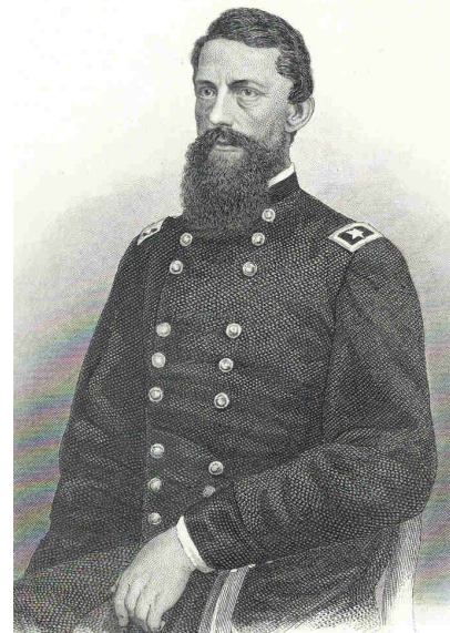
General George Stoneman Jr. Camp 18 Officers

The Lynn Museum/Lynn Arts documents centuries of Lynn’s history, art and culture, including the life of Frederick Douglass, the most avid Freedom Fighter for the Abolition of Slavery, who lived with his family in Lynn for seven years. The Lynn Museum recently completed the highly acclaimed exhibit “ Untold Stories: