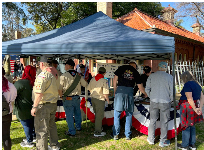
Photo above; many Scouts visited the Camp 18 display. There was a steady flow of visitors all day.

This year is the first pilgrimage/parade after two years of cancellations due to COVID-19 lockdowns and celebrated the 50th Anniversary of the California Inland Empire Council of the Boy Scouts of America.