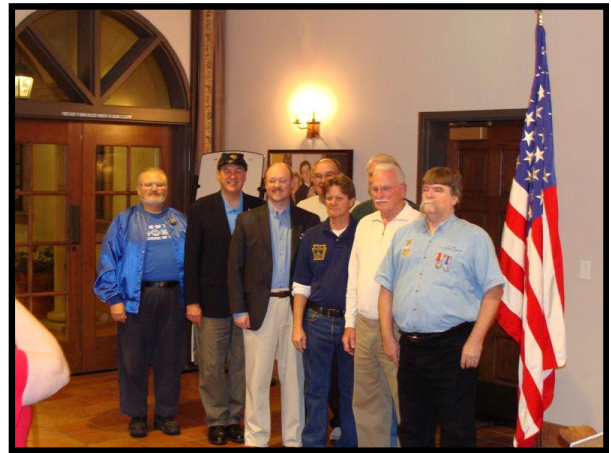
Congratulations to the new Camp Officers!