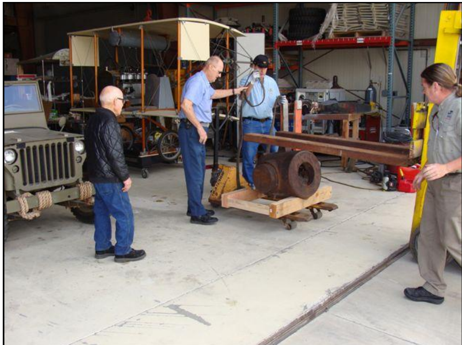
Above, the mortar tube arrives for a much needed restoration at the San Diego Air & Space Museum's annex at Gillespie Field.