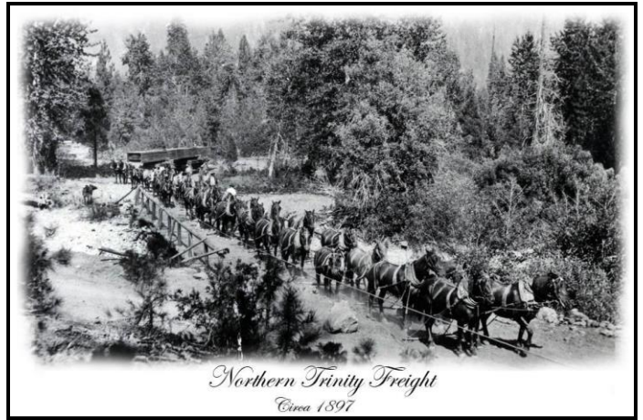
Team of at least 28 and an 8-wheel truck with huge metal beam headed for likely the Bonanza King Mine, Trinity Co.