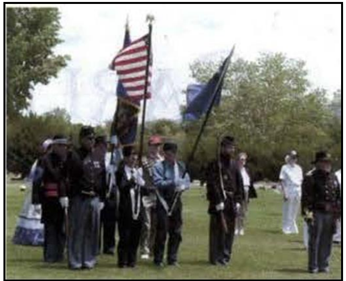
SUVCW Camp 25 Gaurd

Participants included members of the Nevada Air National Color Guard, Sierra Highlander Pipe Band, the Naval Cadet Color Guard, and the SUVCW - General William P. Carlin Camp Guard.”