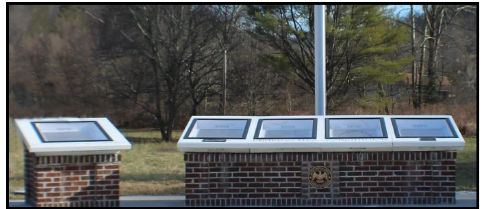
Typical Display of the Charters of Freedom

After waiting several years for the northern Nevada Charters of Freedom experience to come to fruition and to see our donation used, the display will be dedicated at the Nevada Veterans Memorial Plaza at the Sparks Marina on July 1st. Camp 25 will be recognized as a stakeholder, so we would like as many of our members as possible to come out and represent the Camp. If you have child or grandchild, it would be a great time to show them the documents that our country was founded on, and please come in uniform. If you have a correct long arm, please bring it (we will not be firing a salute.) We will also try to locate the brick we purchased for the Nevada Veterans Memorial Plaza (they cannot tell us its exact location).