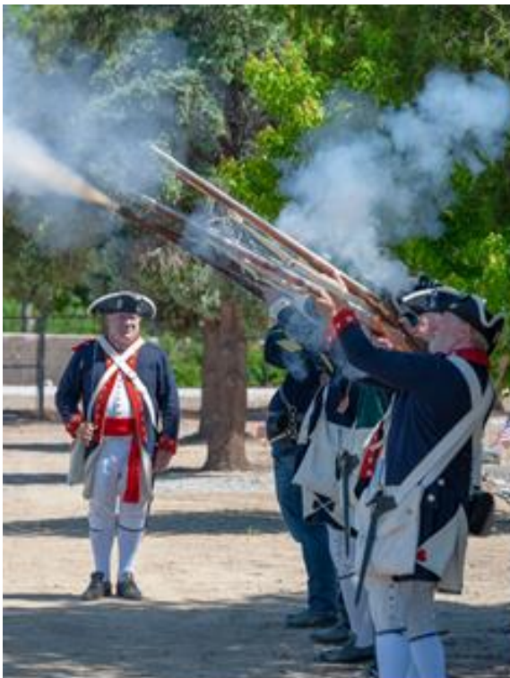
Twenty-one Gun Salute to Honored Veterans