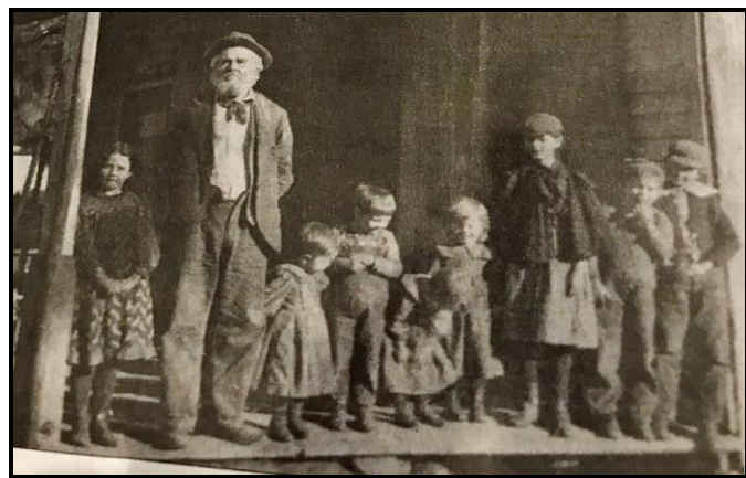
1870's