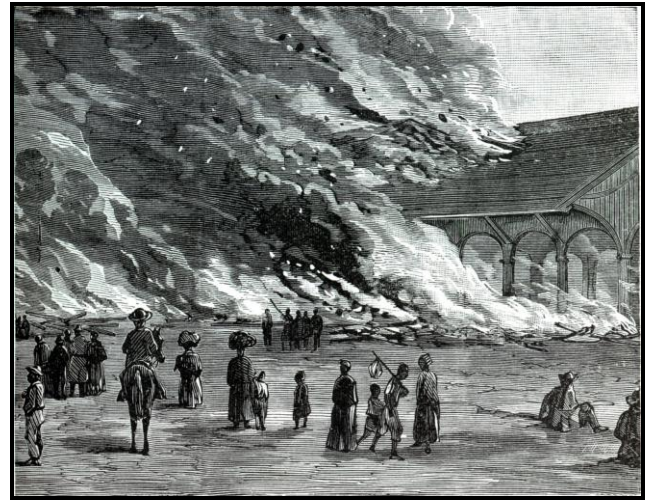
"The Burning of Southern Railroads"