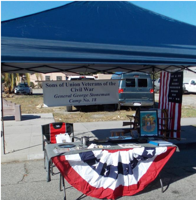
Photo above; the small Camp 18 display at the Veterans' Day parade and Car show in San Bernardino in November, 2015.

Although our display was rather sparse, we had several people stop by and discuss why we are SUVCW. Of special note was Rudy's new banner, hanging in the back of the display, making it easier for people to see who we are.