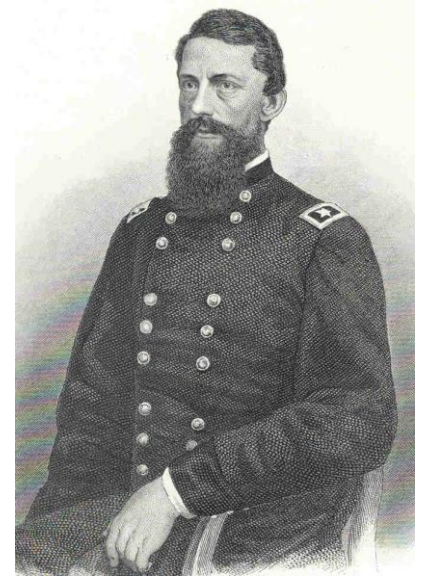
General George Stoneman Jr. Camp 18 Officers