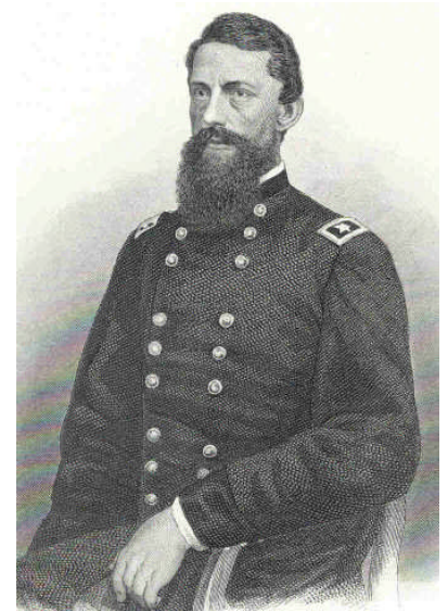
General George Stoneman Jr. Camp 18 Officers