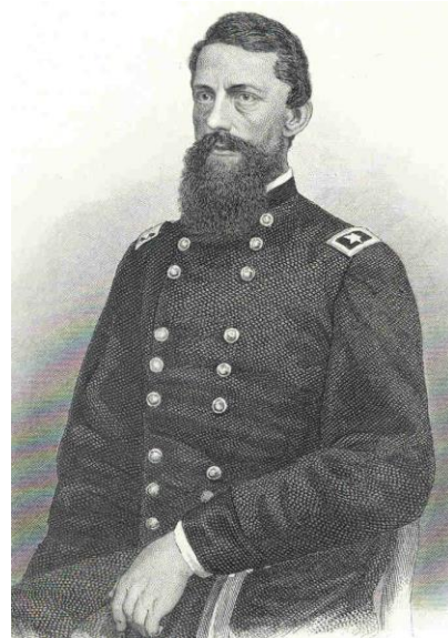
General George Stoneman Jr. Camp 18 Officers