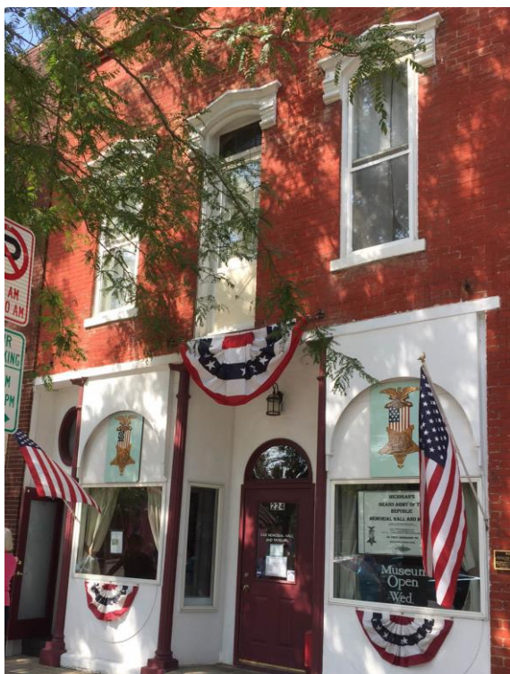
Michigan's GAR Memorial Hall & Museum, 224 S. Main, Eaton Rapids, MI. 48827. Phone: (517)694-9394 Website: garmuseum.weebly.com

Just to the East of the GAR Hall, located in the Middle of the Grand River is an island park. At the request of the Brainerd GAR Post, the city agreed to change the name of the island to GAR Island Park in 1909. From 1909 to 1929 the park was used as the meeting place for the annual week long encampments of the Eaton County Battalion of the GAR. The annual encampments continued until 1929 when there were too few Civil War Veterans to carry on and