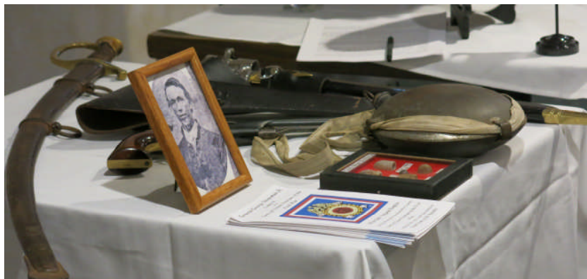
Photo above; a few Civil War weapons and accouterments for display at the Tent meeting.

meetings, opened in a formal fashion. The ladies initiated a new member during the first half of their meeting before breaking for a baked chicken breast lunch that was very enjoyable.