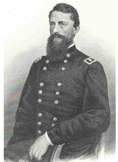
General George Stoneman Jr. Camp 18 Officers