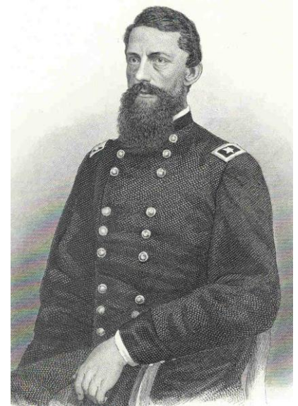
General George Stoneman Jr. Camp 18 Officers