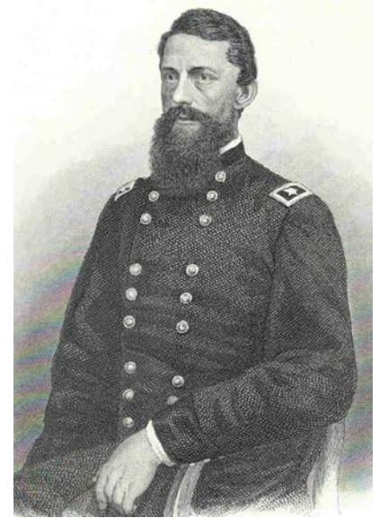
General George Stoneman Jr. Camp 18 Officers