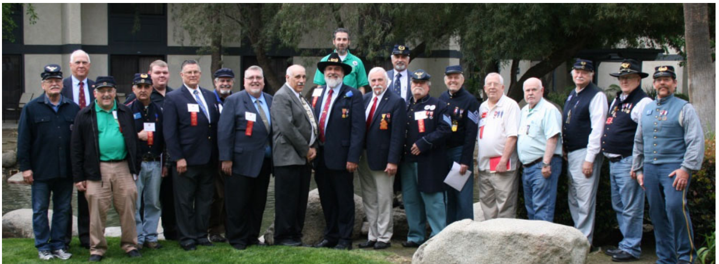
Photo above; SUVCW Brothers attending the 132 nd Department Encampment in Bakersfield, CA. on 17 March 2018. How many of your Brothers do you recognize?