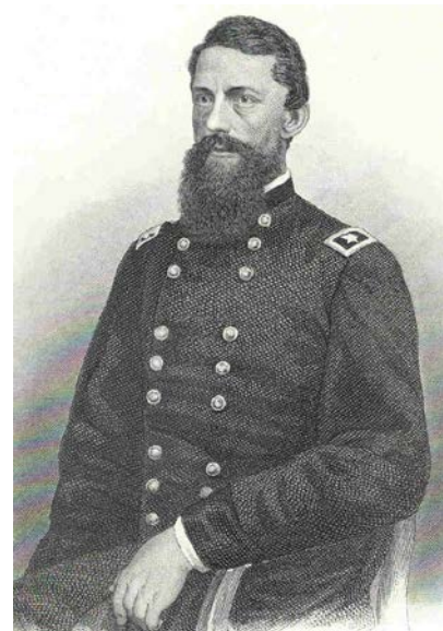
General George Stoneman Jr. Camp 18 Officers