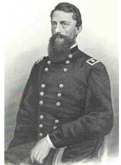
General George Stoneman Jr. Camp 18 Officers

The Lincoln Dinner is a great event that includes a formal dinner and a keynote address from a noted Lincoln and/or Civil War Scholar. More details will be available in January. If you are interested or have any questions, contact the Shrine at (909) 798-7632 or email; www.lincolnshrine.org