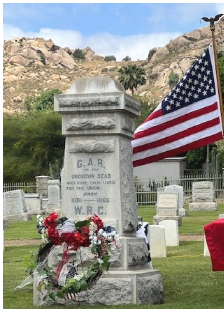
Above, the GAR monument at Evergreen Cemetery