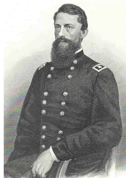
General George Stoneman Jr. Camp 18 Officers