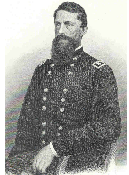
General George Stoneman Jr. Camp 18 Officers