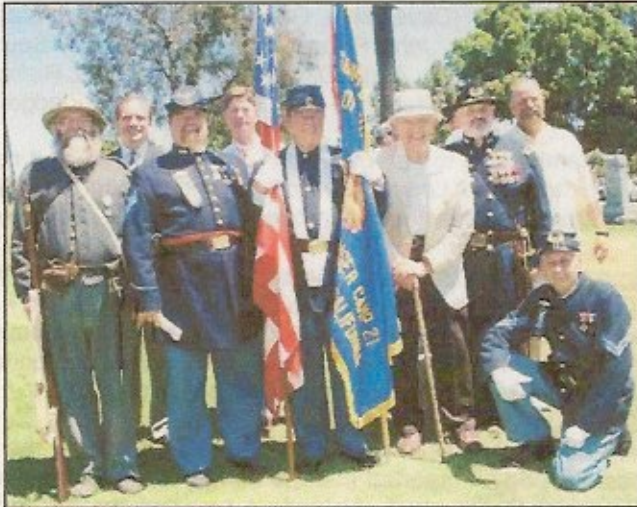
Camp Brothers pose for photo after Memorial Day ceremony held at Mt. Hope Cemetery in San Diego.