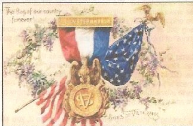
SONS OF VETERANS POSTCARD - Ca 1910