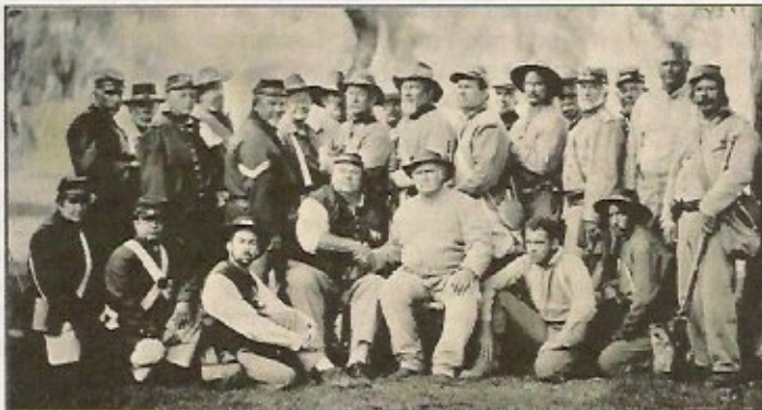
Period photographic technique was used to take this picture of some Union (SUV) & Confederate attendees at the 2004 "Civil War Revisited" event in Fresno, CA in Sept.