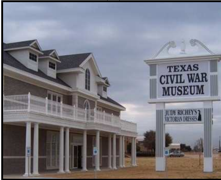
Sign and Bldg. at 760 Jim Wright Fwy N, Fort Worth, TX, are easy to spot along I-820 at the Clifford St. Exit.

bought for his daughter. The Texas area of the collection includes a very rare medal struck by the citizens of Galveston following the Confederate victory at the Battle of Sabine Pass. There were only 30 made. Billed as "the largest collection of Civil War artifacts west of the Mississippi River," the museum is definitely worth a long, leisurely visit. And, of course, they have a well-stocked gift shop, with something for everyone. On my last visit, I picked up a DVD copy of Walt Disney's, "The Great Locomotive Chase," starring Fess Parker. You might be familiar with that story (grin). The best part for me: it is less than two miles from my house!