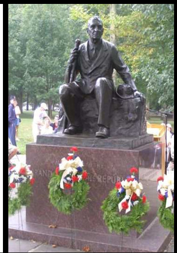
At Right; the GAR-Comrade Woolson Monument in Zeigler's Grove, Gettysburg NMP, following the Encampment's re-dedication ceremony.