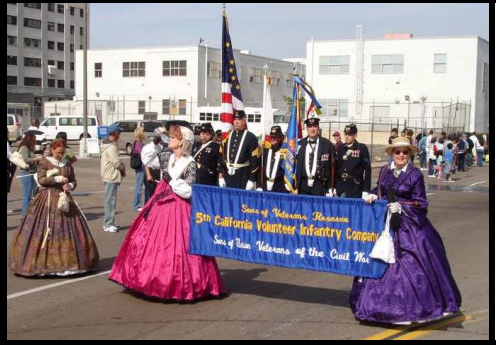
At 11am, on 11 Nov 1918 WWI ends. At 11am on 11 Nov 2006 that event was marked by a parade in SD: our SVR unit was there with our ladies in the lead !