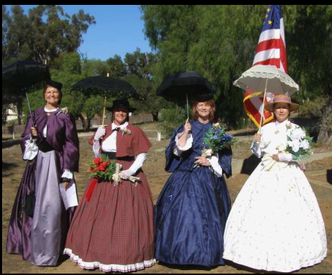
Pittenger Camp ladies at Remembrance Day ceremonies at OddFellows Cemetery