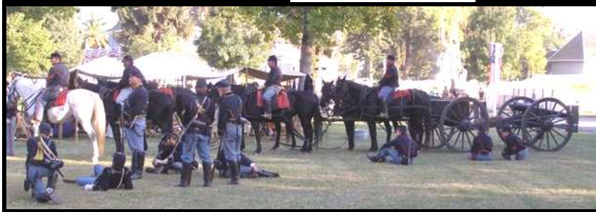
A six-horse drawn 12-pounder Napoleon complete with limber and troopers is readied for battle.