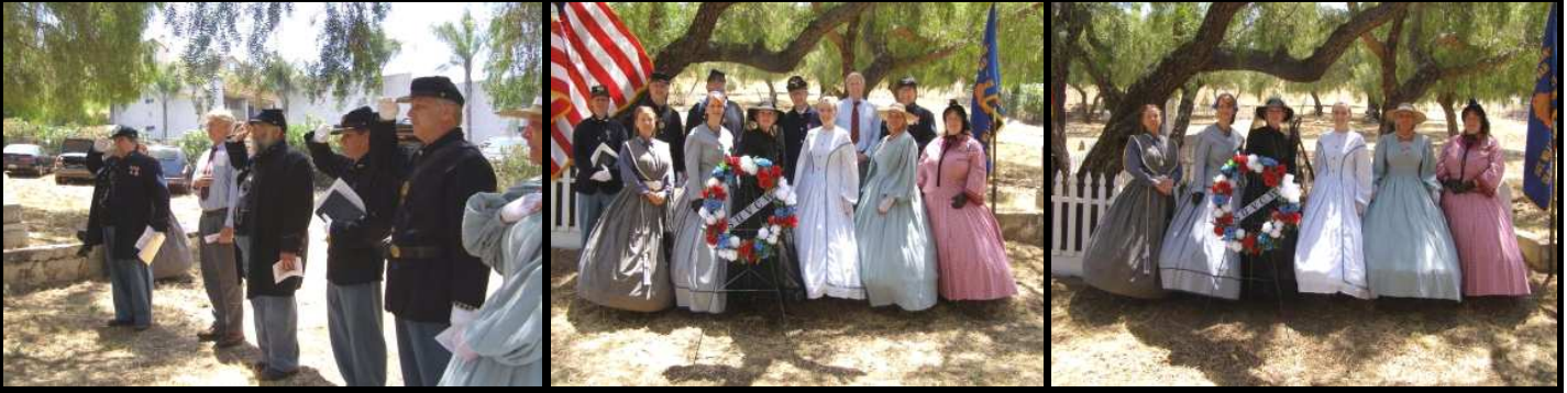
23 May, Mem. Day, Fallbrook Oddfellows Cemetery, Camp Brothers & Sisters assemble to remember our Honored Dead