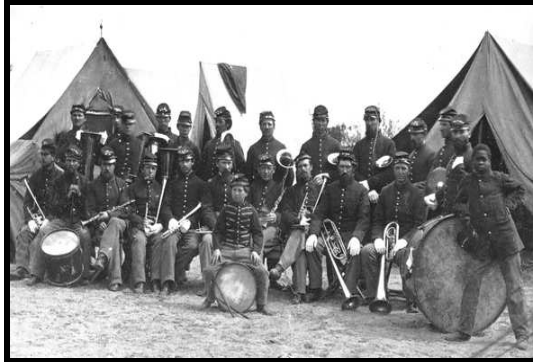
3rd New Hampshire Inf. Band with instruments at camp in Hilton Head, SC.