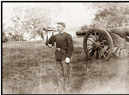
Unknown bugler with large field artillery piece, location unknown

cians under orders from Sheridan played Nelly Bly while being shot at on the front lines. Samuel P. Heintzelman, the commander of the III Corps, saw many of his musicians cowering at the back lines at the Battle of Williamsburg, and ordered them to play anything, as it appeared it was all they were good for. Their music rallied the Union forces, forcing the Confederates to withdraw. It was said that music was the equivalent of "a thousand men" on one's side. Robert E. Lee himself said, "I don't think we could have an army without music." Often, musicians were ordered to leave the battlefield and assist the surgeons. One notable time was the 20th Maine's musicians at Little Round Top. As the rest of the