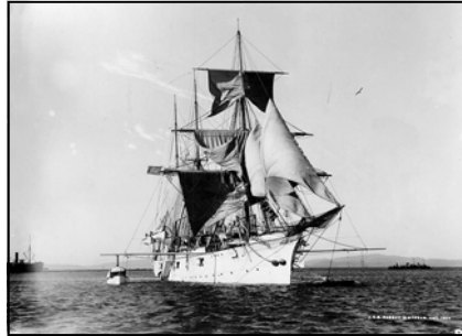
USS Ranger, 1899

At the cemetery the ritualistic exercises of the G. A. R. were carried out with no added features, not even an address being made. These exercises were followed by the decoration of the graves, in which all joined. Members of