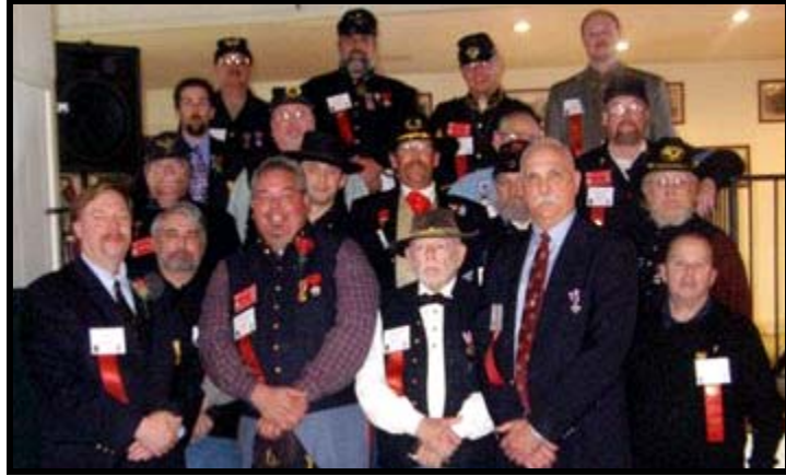
Congratulations to the newly elected and appointed officers of the Department of California & Pacific!