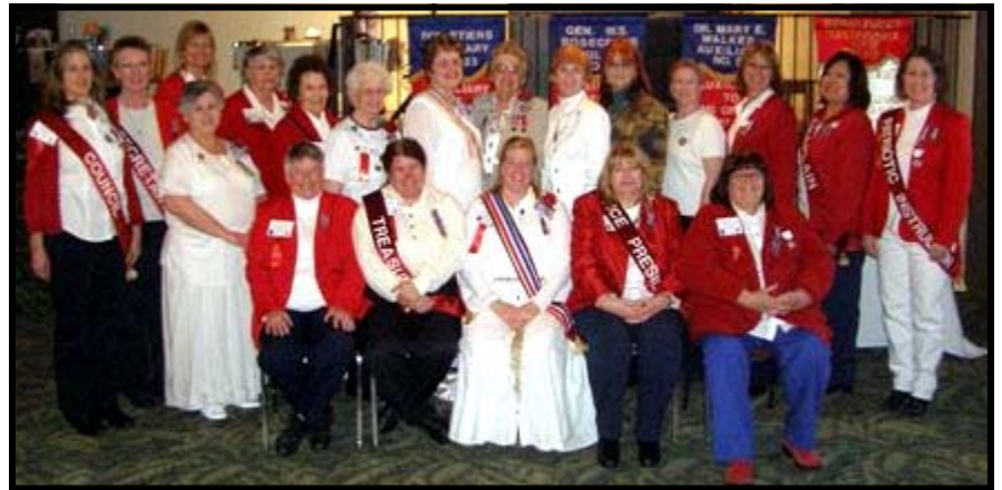
Congratulations to the Auxiliary on their 100th Anniversary!