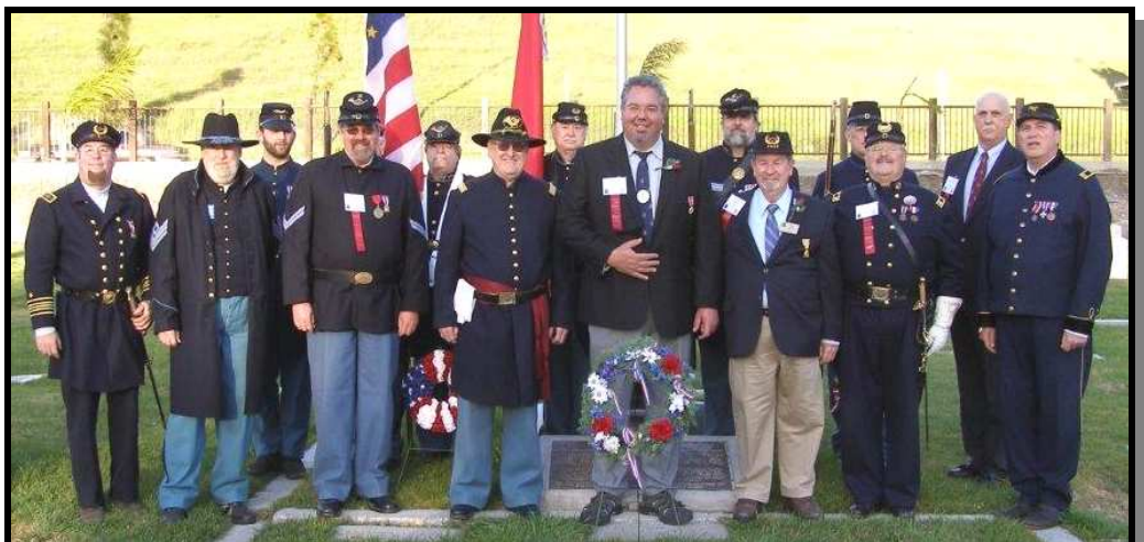
All Dept. of Cal & Pacific Brothers who are also SVR members assembled after the GAR cemetery memorial service at the conclusion of the 125th Annual Encampment