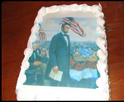
We celebrated Pres. Lincoln's Birthday with this beautiful and tasty cake at the February meeting.