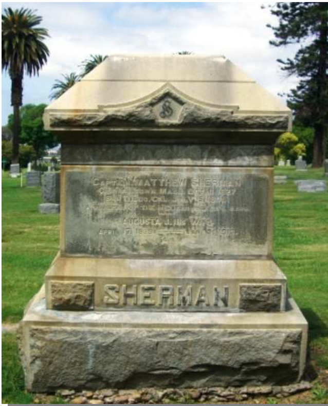
Mount Hope Cemetery, Division 3, Section 9, Lot 1, Grave 14