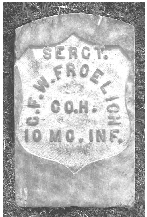
Mount Hope Cemetery, San Diego, CA

Burial: Mount Hope Cemetery, San Diego, California Plot: Grand Army of the Republic, Section 3, Lot 53, Grave 3-A