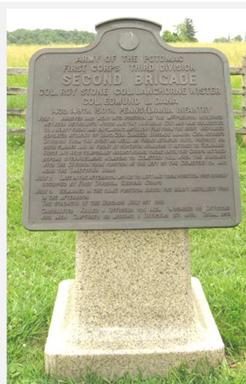
The headquarters marker for the Second Brigade, Third Division of the First Army Corps is west of Gettysburg on Meredith Avenue.

July 1. Arrived and went into position at McPherson buildings between Reynolds Woods and the Railroad Cut and was subjected to a heavy front and enfilad-