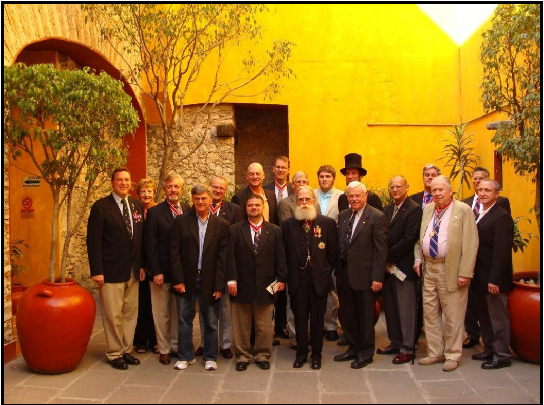
Above, the MOLLUS and SUVCW delegation to Puebla pose for a group photograph.

The next morning was the Parade, which included, as all parades do, a good bit of waiting to get into position. The time went away quickly as we were surrounded by groups of junior high age kids who ALL wanted their pictures taken with us. They were just delightful, friendly and intrigued by our uniforms, especially the hats. The kids were in the parade por-