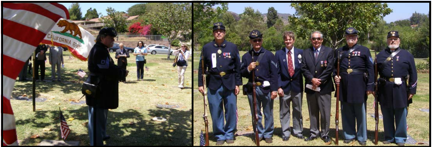
Above, Memorial Day observances took place on Sunday, May 27, 2012 at El Cajon Cemetery in El Cajon, California. The ceremonies were under the auspices of Elks Lodge No. 1812 with members of the William Pittenger Camp participating.