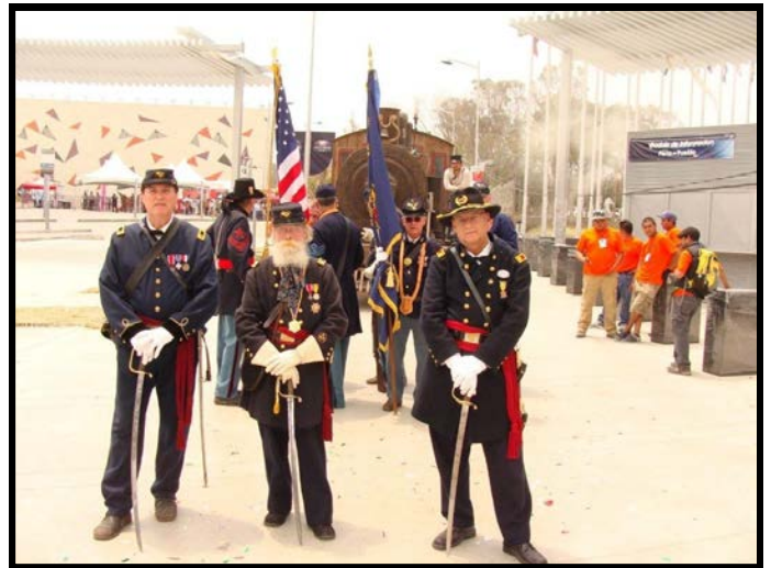
Above, SVR members take part in historic commemoration.

ing, it was probably about five miles of walking and marching. However, the crowd was estimated to be between 350,000 and one million people. The crowd lining the road was at least fifteen deep and included many dignitaries, including Pres. Felipe Calderon of Mexico, the governor of the State of Puebla and many others.