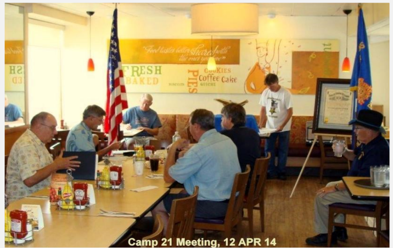
Camp 21 Meeting, 12 APR 14