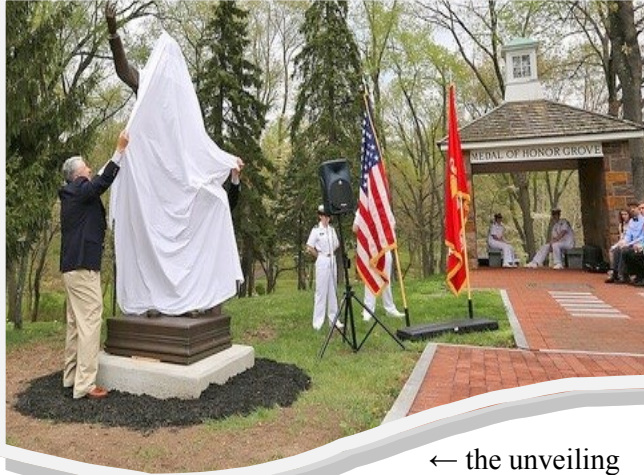
← the unveiling