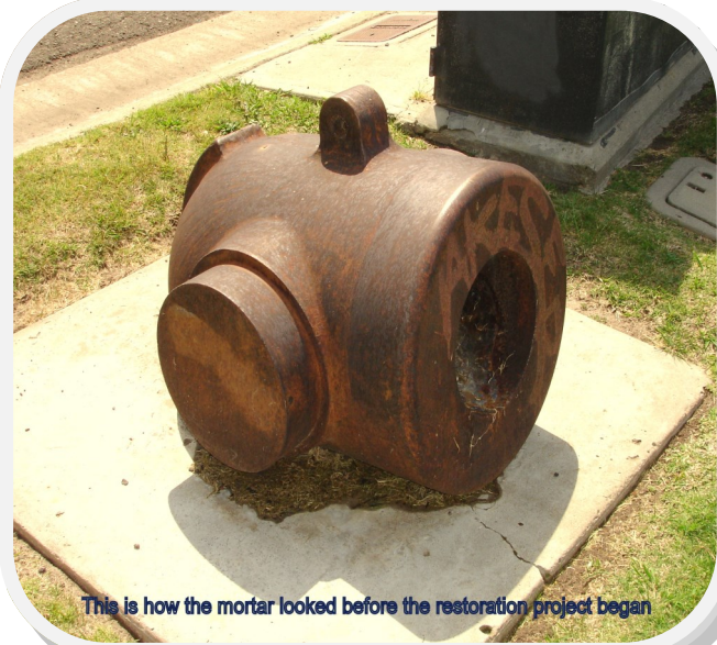
This is how the mortar looked before the restoration project began

carriage in 2011 and then began to manufacture it. Although the carriage is not an exact replica, it mimics the original almost perfectly. Our Camp Brothers helped by donating money, time and work. Over a period of two years the Mortar was returned to GAR Hill in April 2014 as a gift to the Memory of the Boys in Blue and their families and the City of San Diego who are very, very pleased with our efforts. Our Brothers as a team need no thanks but satisfaction for a completed goal of their fine memory is reward enough. Interesting facts about the Mortar: It would fire a 10" shell or ball one mile on 4 pounds of powder. It would take down a ship of great size with a direct hit. The original Mortar and Carriage weighed two tons and was transported on a retractable caisson metal carriage for deployment. It had replaceable parts such as the trunnion caps that during firing would become non functional over sustained battle. Many thanks to all Camp Brothers and the San Diego