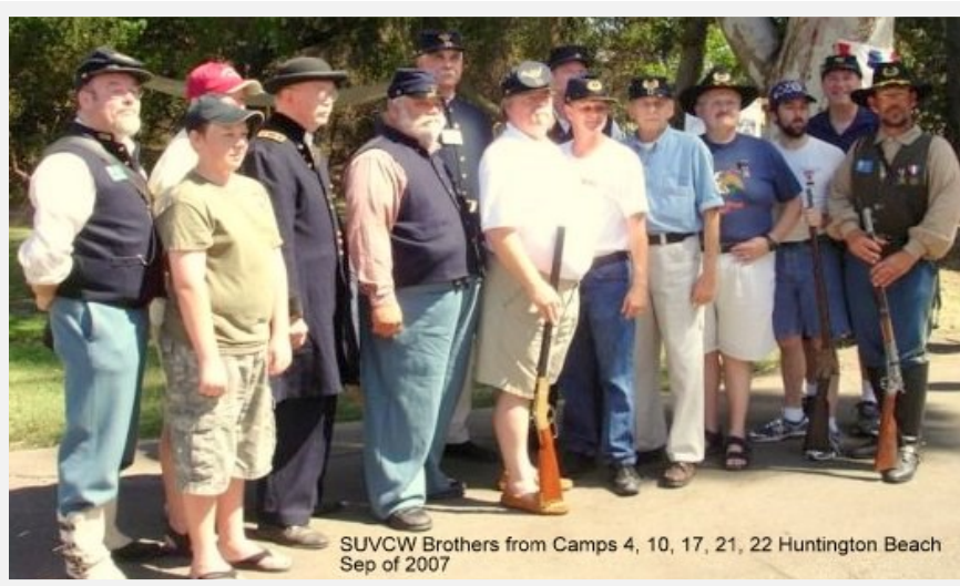
SUVCW Brothers from Camps 4, 10, 17, 21, 22 Huntington Beach Sep of 2007