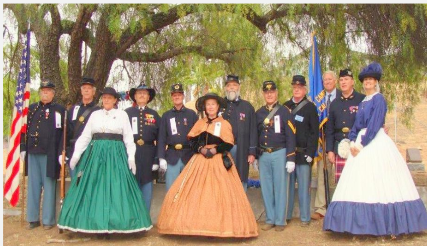
24 May, OddFellows Memorial Cemetery, Fallbrook, CA. Sgt. Wm. Pittenger Camp 21 Brothers and Ladies commemorate Memorial Day