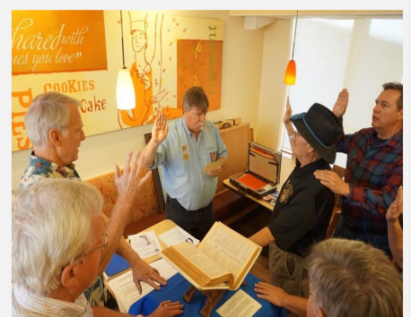
Photos from the December Camp meeting, election and installation of 2015 Officers, and below, the drawing by our waitress for the M1860 Repro Colt revolver, at right—the winning ticket, & three Camp 1st Ladies !!