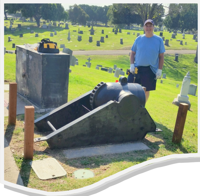
The rails were set on top of stakes placed down in the ground at the four corners

Editor's Note: Photos by Eileen Tisch taken at the installation of the posts and chain surrounding the siege mortar atop "GAR Hill" at Mt. Hope Cemetery.