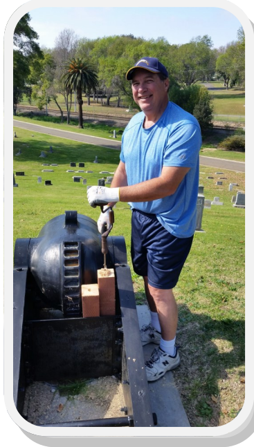
Will drilling a hole in the wood for the rails to go around the Mortar