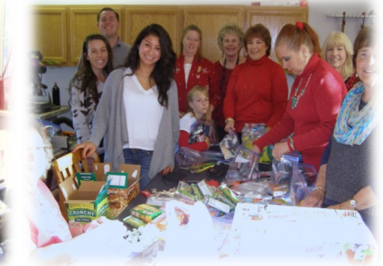
Above L; putting items into bags,