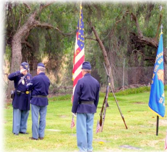
Camp 21 has participated with the El Cajon Elks Lodge 1812 honoring a Veteran interred in this cemetery for a number of years.