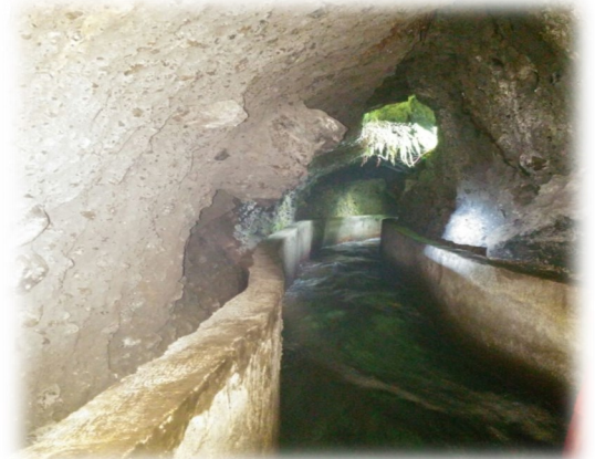
Right: Tunnel from Tiu Kelep Waterfall