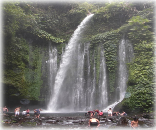
Left: Tiu Kelep Waterfall