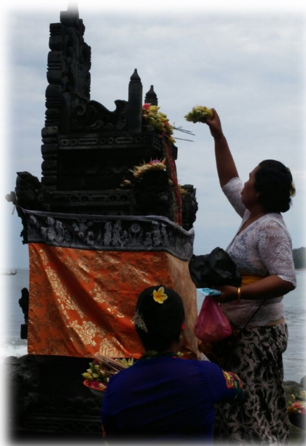
Hindu Temple Offering