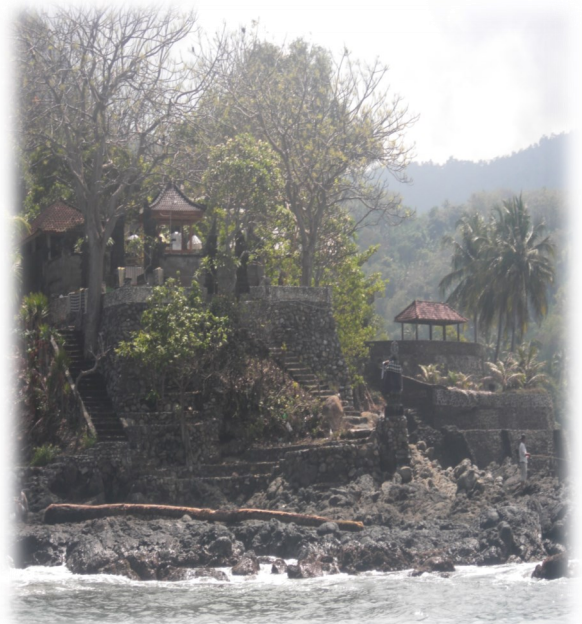
Hindu Temple on Oceanfront