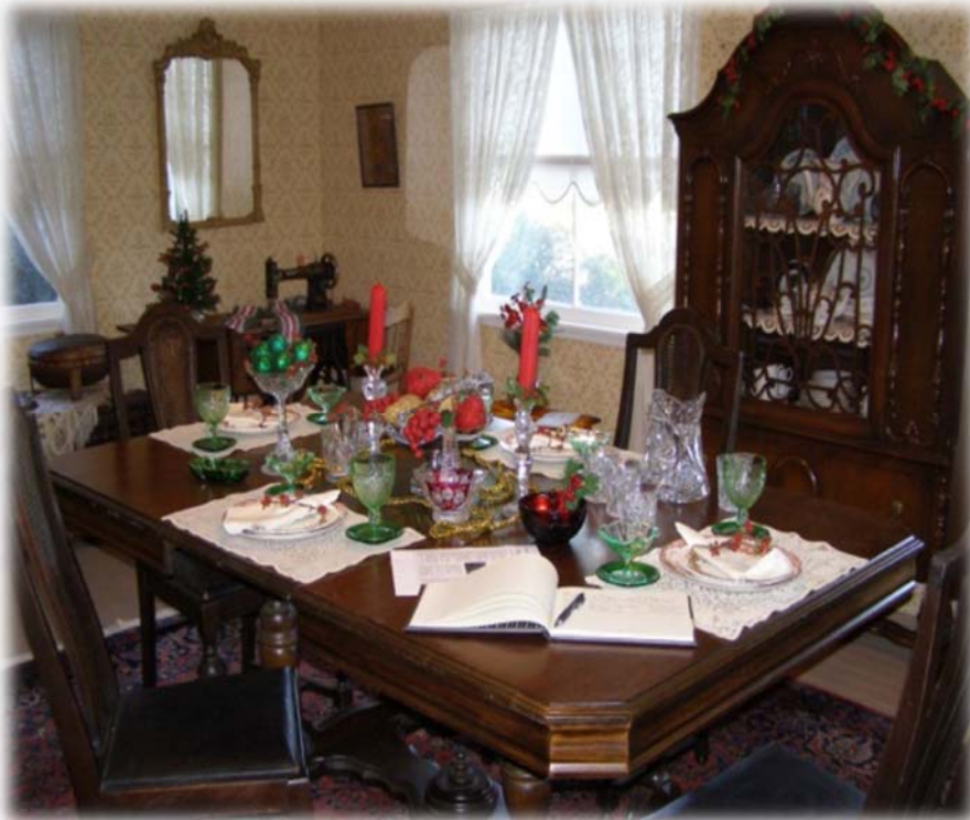
CHRISTMAS AT THE PITTENGER HOUSE (Cont)

Following our December meeting and installation of 2017 Officers at Mimi's, we enjoyed a meal sharing Brother's and Sister's fellowship in the relaxed atmosphere of the private room the restaurant provides free-of-charge. This was our largest turnout of the year—great to see so many there !