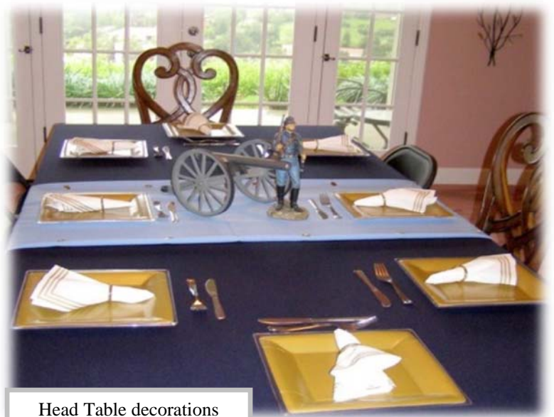
Head Table decorations