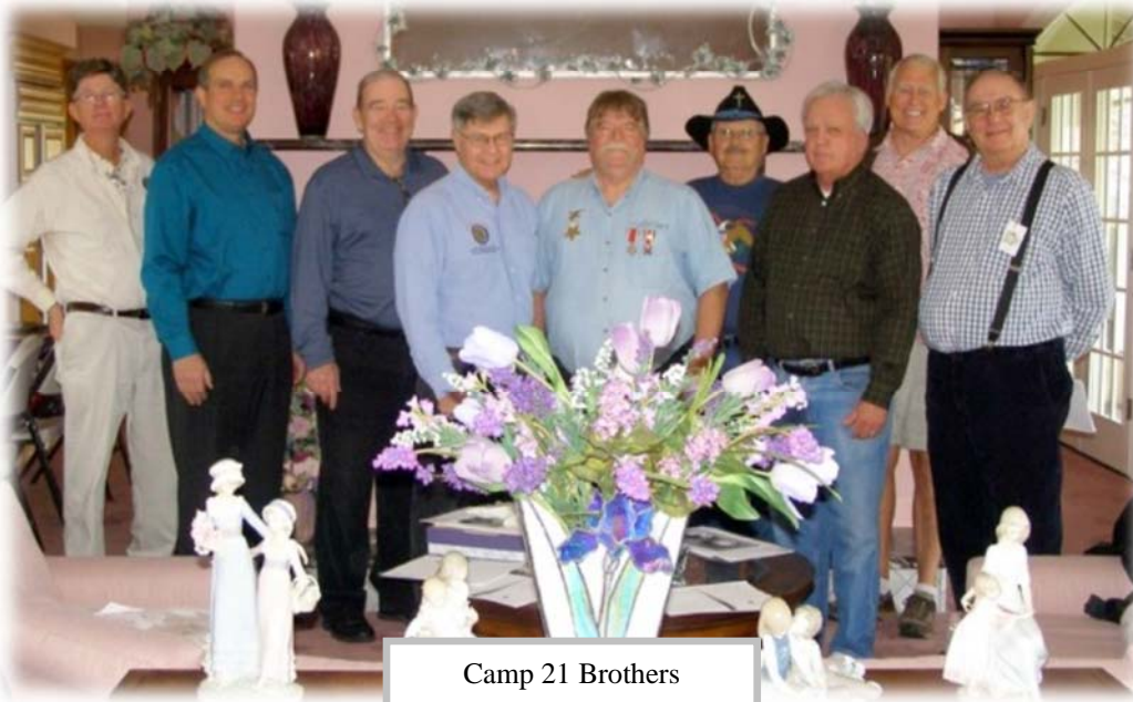
Camp 21 Brothers