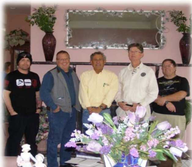
Guests, Camp 302, Sons of Confederate Veterans