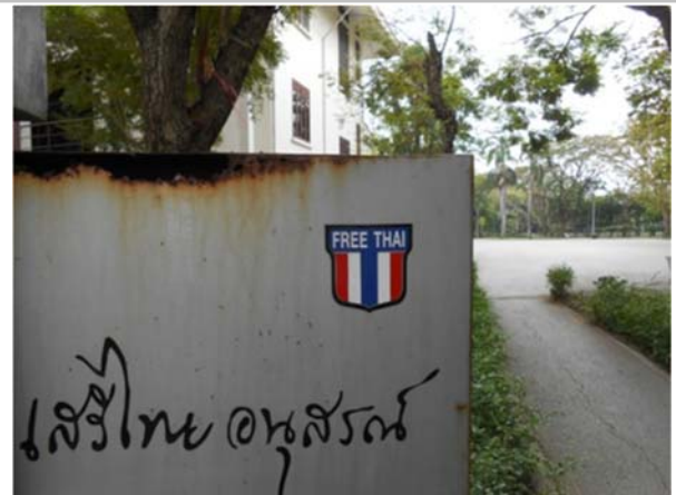
Seri Thai Park sign close-up (The only English in the park ...)