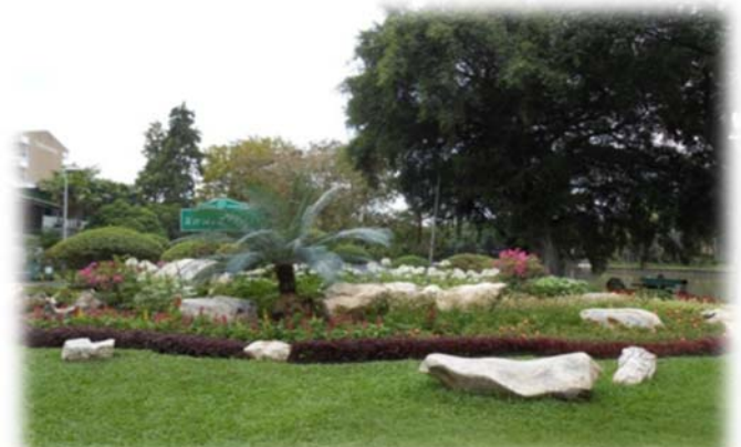
Entrance to Seri Thai Park