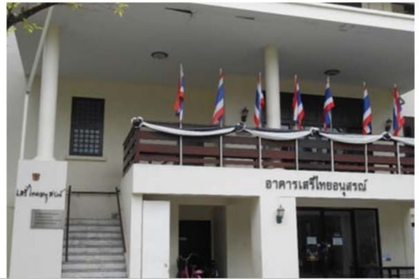
Seri Thai Museum (Note Free Thai patch, far left, the museum is on the second floor)

and served recently in Iraq as well, with Thailand a longtime U.S. friend and treaty ally. There is a Seri Thai Park and Museum in Bangkok, dedicated to the Free Thai of World War II. When I visited the park and museum recently, the museum was closed for renovations but I managed to talk the girls there into letting me look around for just five minutes as long as I didn't take any pictures inside. Pictures were permitted outside.