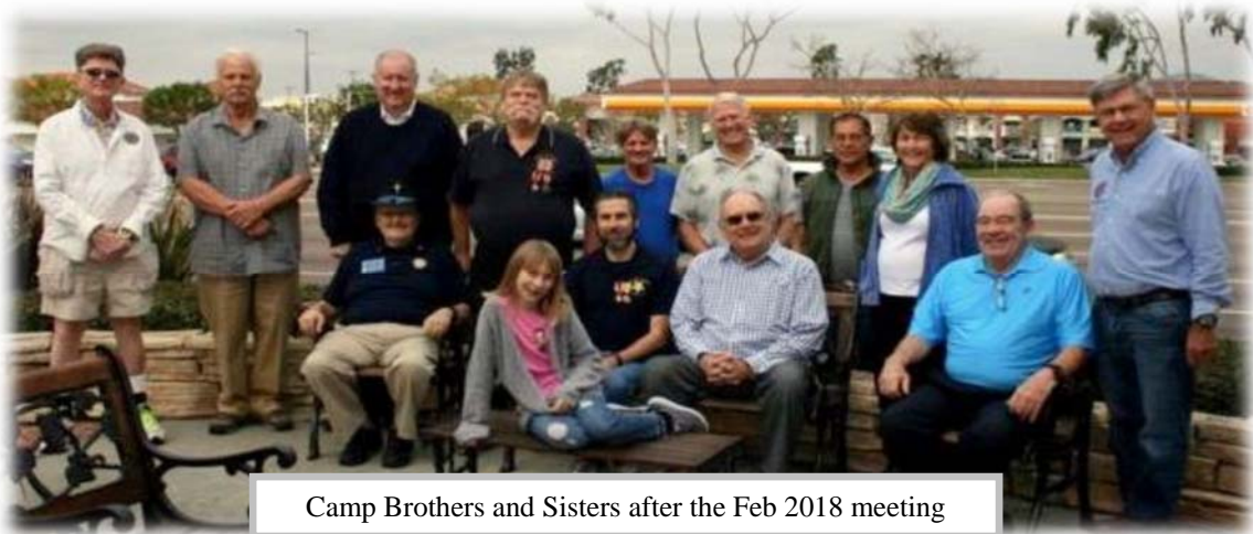
Camp Brothers and Sisters after the Feb 2018 meeting