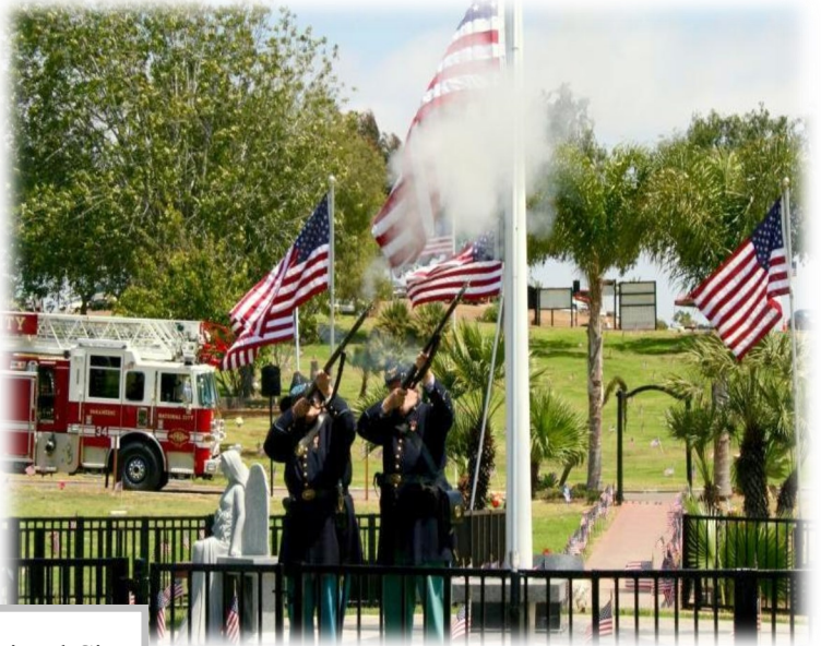
LaVista National City