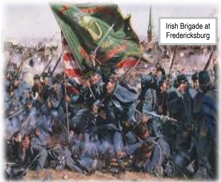
Irish Brigade at Fredericksburg

He had seen enough of the bravery of the Irish previously at the battle of Antietam. Ironically, the Irish Brigade’s charge was met by one of the few Irish regiments in the South, the 24 th Georgia. The 10 th Tennessee was also a predominantly Irish Confederate regiment. The 33d Virginia had one company of Irish dubbed the Emerald Guard. They are credited historically with initiating the famed rebel yell while attacking at 1 st Bull Run. Irish clergy figured prominently in the war. The most famous was Father William Corby. He was the chaplain of the Irish Brigade and before they were sent into the maelstrom of combat on the 2d day of fighting at Gettysburg, he gave them general