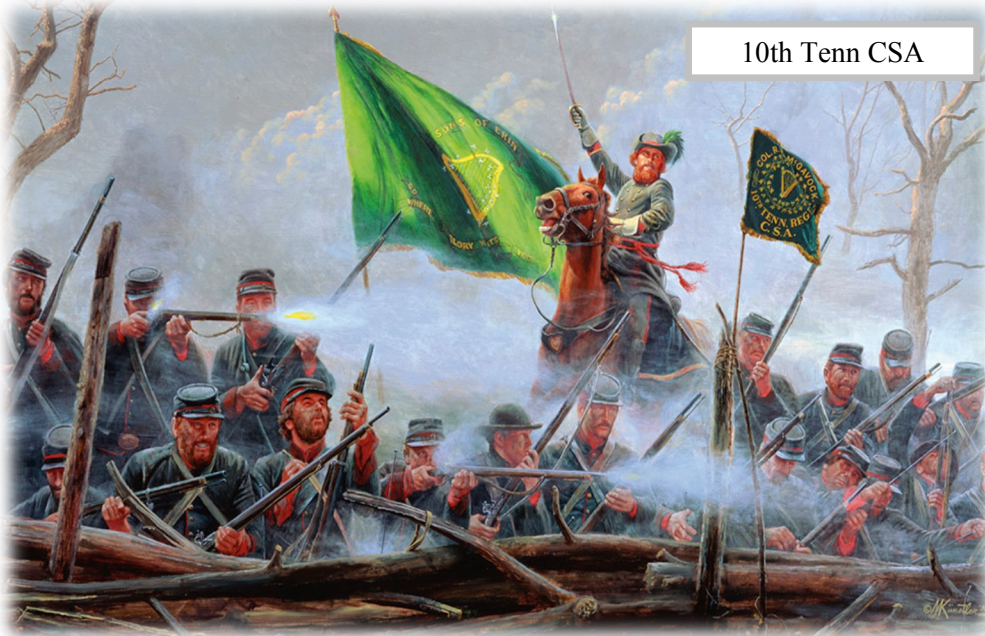
10th Tenn CSA

absolution while standing on a rock. He told them, "Let everyman do his duty. For he who does not and is slain, will have his body returned with a letter from me to his parish priest to deny him a Christian burial." He went on to be the President of Notre Dame where legend has it he taught Knute Rockne motivational speaking. The Irish fought with valor throughout the conflict. After the war, a former Confederate General, was asked why the South lost: he replied, "The North had more Irish."